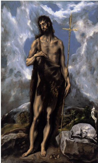
Wednesday, June 24: The Nativity of St. John the Baptist