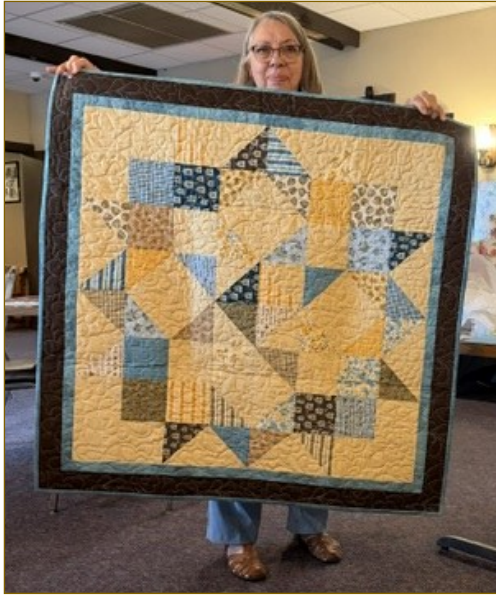
Ladies' Night Out