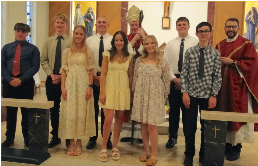
2026 Confirmation Class