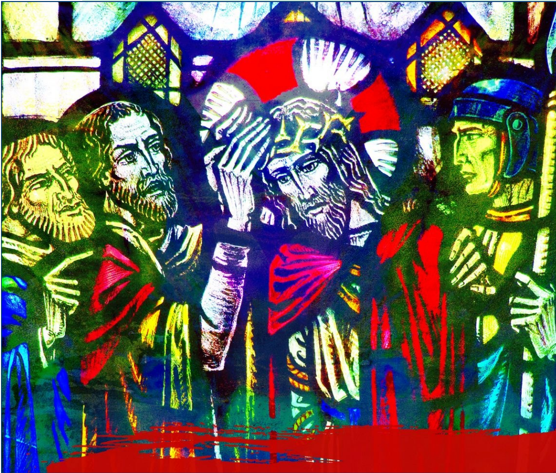
Christ, King of the Universe ~ All Saints Parish