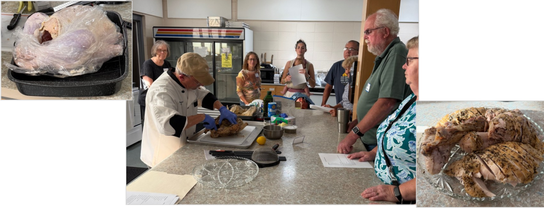
A big thank you to all who attended the turkey cooking/carving class on Tuesday. It was a great class, and we learned a lot!