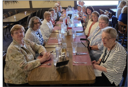
Ladies' Night Out at Old Towne Inn

Our Pastoral Council is here to serve. They help us discern the needs of our community and the call of the Spirit in our time. If you wish to speak with a Council member about your concerns, please contact the parish office - 608-637-7711 or stmaryparish@mwt.net .