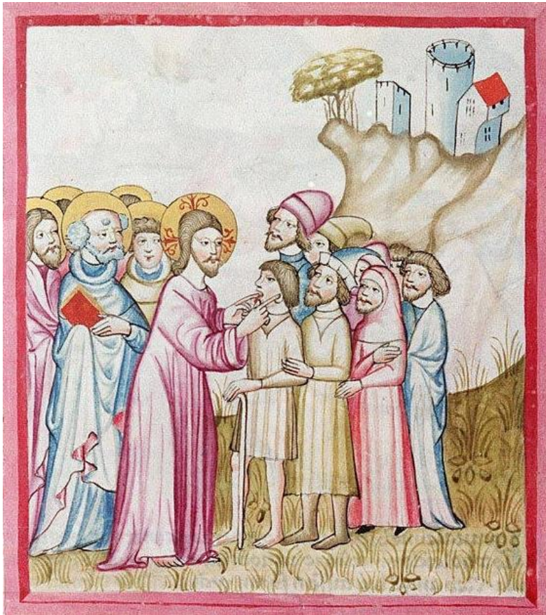
"Cura surdo mudo", 5th century